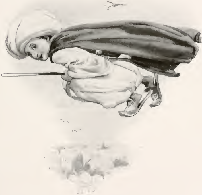
He found himself flying through the clouds (P. 67.)

“The overseer was amused, and told him to hold himself in readiness to run a race that very evening, then, taking him into the kitchen, he ordered him to be supplied with plenty to eat and drink.